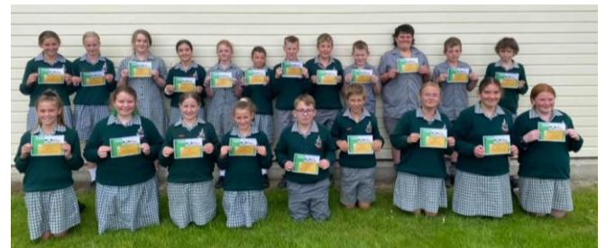
Year 7 students who have achieved their 120 Big award badge.