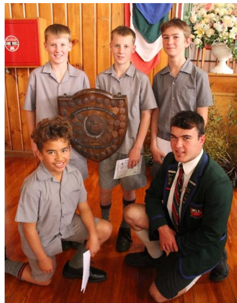
Congratulations Leadbetter House on winning the House Shield

Thank you to parents, caregivers and friends of the school for attending Junior Prizegiving, our special grand finale for the school year. It was great to see so many students receiving acknowledgement for their outstanding achievements.