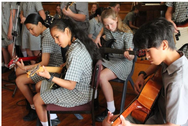
Year 9 Music class performing at Junior Prizegiving

Last Wednesday we had the Big A prize draw. In the prize draw were all students who achieved at least 40 Big As. For each set of 40s received, their name went in again.