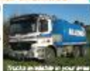
Trucks available in your area